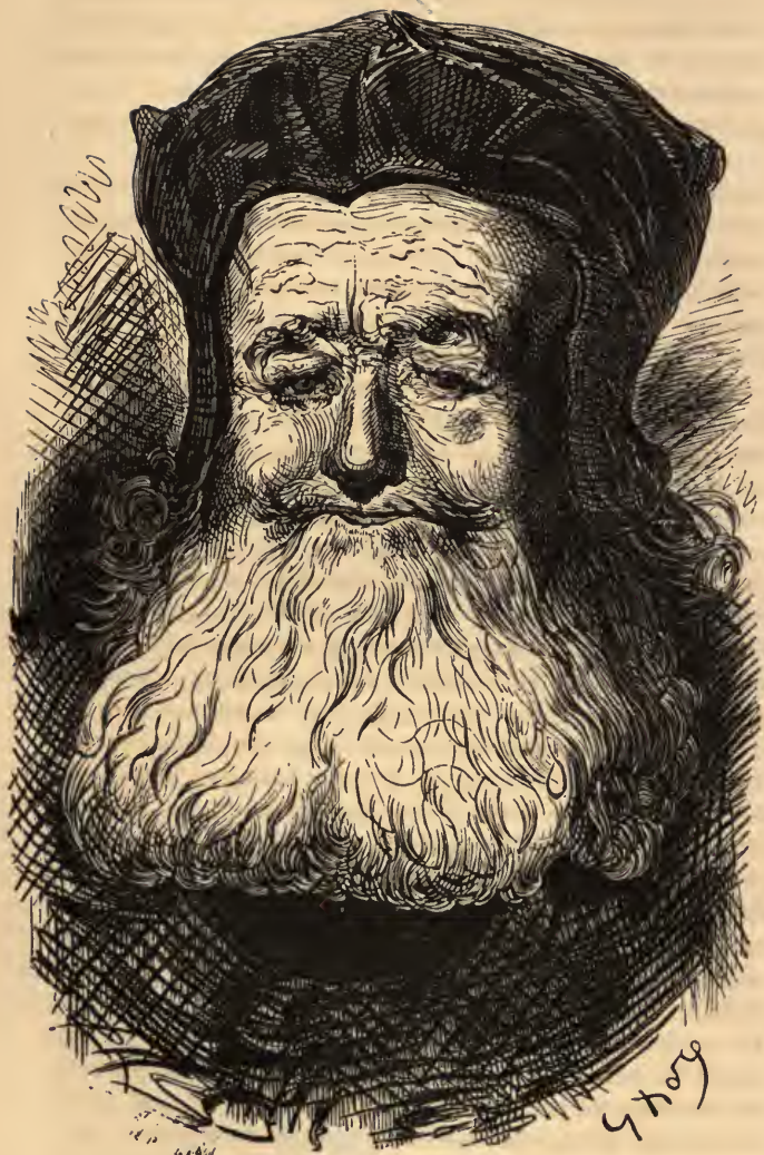
The merry Vicar of Meudon.